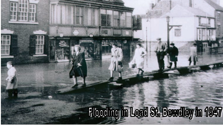
Flooding in Load St, Bewdley in 1947

There are, no doubt, those amongst you who remember the awful winter of 1947... which started 70 years ago this month. Let's hope history does not repeat itself, as like this year, early January was unseasonably mild. However, the bitter blast started on 19th January 1947, and from 22nd January to March 17th, snow fell every day somewhere in the UK. However, compounding the bad weather, the country was very short of fuel, and very reliant on coal. Many people heated their homes and/or cooked with it, and the power stations were totally dependent on it. With transport grinding to a halt due to the heavy snowfalls—some people woke to snow covering their ground floor windows, and had to dig their way out from their own doors—many people were laid off work, with factories closing due to shortage of materials and fuel. Vegetables were frozen in the ground, and so with little food, little fuel and work, people generally had a very hard time. The final ten days of March 1947 were exceptionally wet with 36.3mm of rain. This, and the water resulting from the melting snow, caused widespread flooding along the river valleys. This was particularly severe along the Severn, with Bridgnorth, Bewdley (before the flood barriers were even thought of) and Worcester badly hit, the river at Bewdley peaking at a record 5.84m in March, causing more heartache. A flood marker can be seen at Blackstone Pumping Station showing this level.