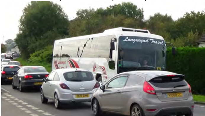
Traffic Chaos in Shatterford on the A442

This Parish newsletter advised everyone in the April edition that this event was going to take place, and yet it still caught out many people, despite efforts to publicise it. The main problem locally was the closure of the A442, causing traffic mayhem in Shatterford, and the closure of the Habberley Lane. In effect these two closures cut off much of the parish from access to Bewdley or Kidderminster from 7.30a.m. to 2.30p.m. on Sunday 24th September.