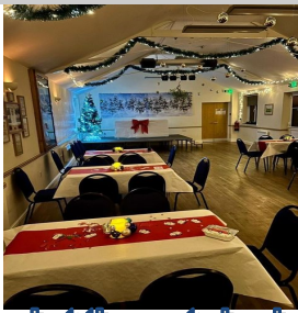
Let the party begin

24th February —Kurling Event 11th May —Trimpley Quiz Night Further information available via the website. Please support the Hall. www.trimpleyvillagehall.org On 9th December a successful Christmas Party Night brought the local Festive Celebrations in the parish to a very enjoyable start. Thanks to all who helped to organise.