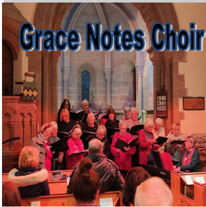
Grace Notes Choir